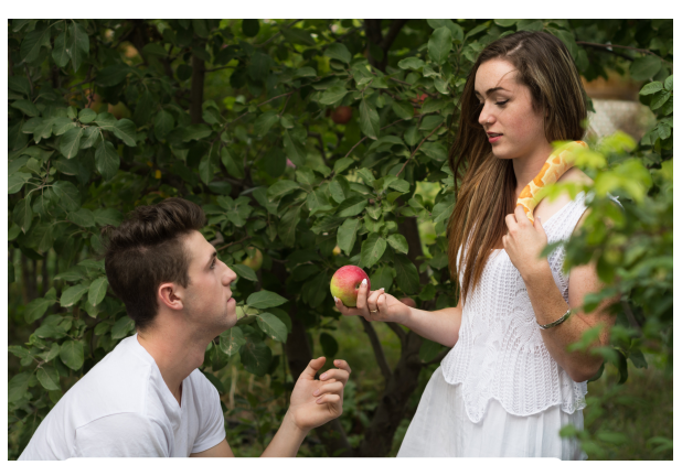
Adam and Eve rejected God's sovereignty in the Garden

effects of their decision still resound today. When our first parents rejected God, their children inherited that state of rebellion (Romans 5:12). For that reason, all of us on earth have inherited sin. Sin is defined as disobedience to God (Read: 1 John 3:4). There is suffering in the world because humankind rebelled against our Creator, God allows suffering because He does not force anyone to follow Him. If He swooped in and saved the day, there could be a chance for another rebellion. By allowing us to try every option of ruling ourselves, God is preventing further rebellion in the future.