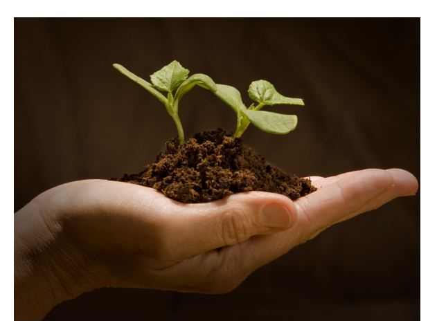
Creation reveals God's invisible qualities