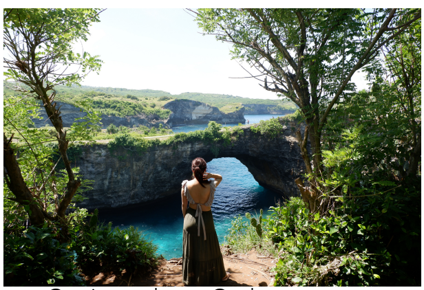
Getting to know God puts us on the path to everlasting life

have sent." (John 17:3) This verse impresses upon us the importance of getting to know God; it isn't just about finding friendship with our Creator - in of itself already a wonderful gift! But to know God puts us on the road to everlasting life!