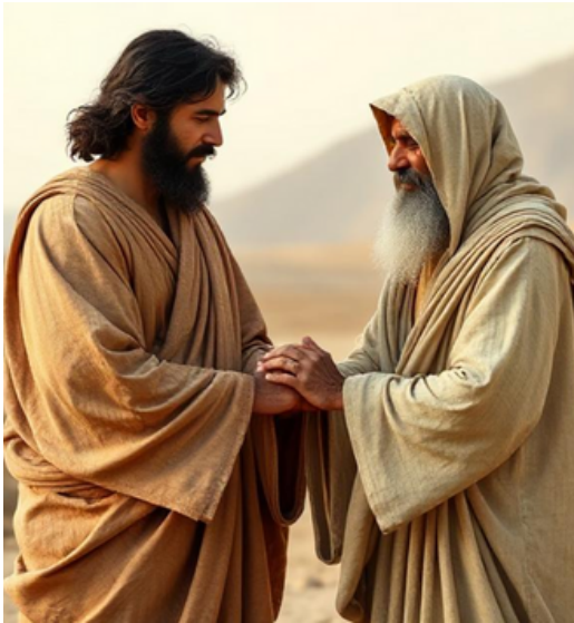
Jesus lovingly healed a man with leprosy

How does Jesus response, "I will" or "I want to" show Jesus to be a caring teacher?