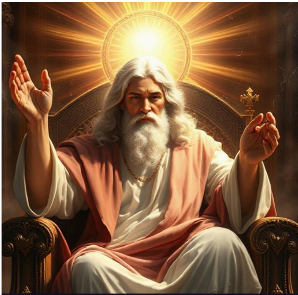
Jesus sits on a throne in heaven as "King of Kings" and "Lord of Lords"

Discussion: What is Jesus' relationship with his Father?